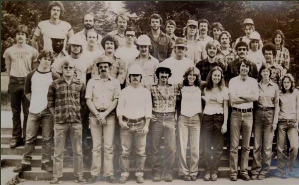
Summer Camp, 1979