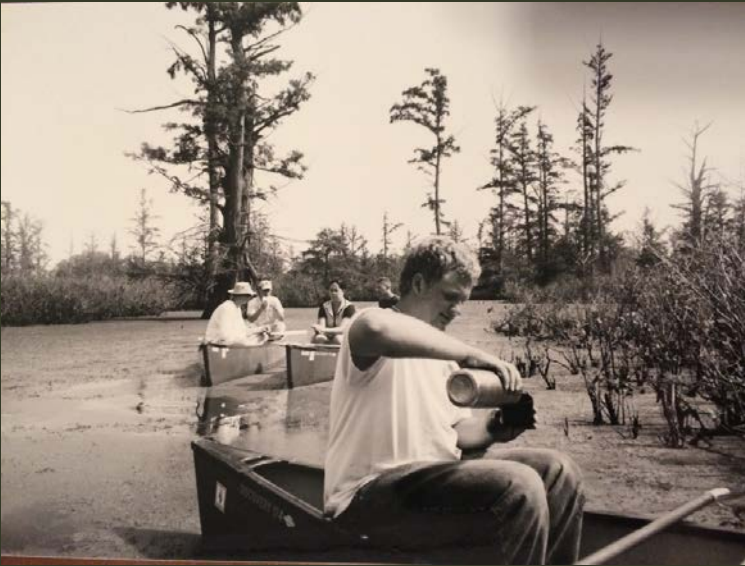
Cache River Float, circa 2001