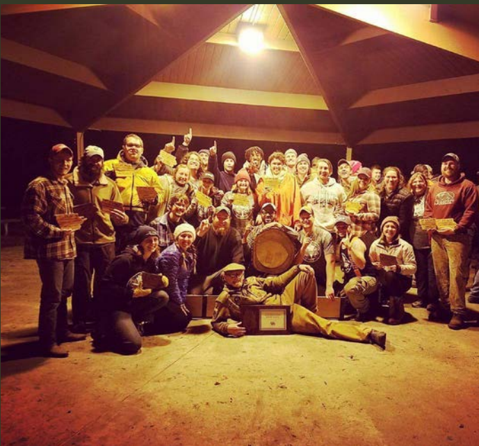
Conclave Victory, 2017