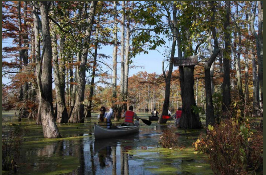
FOR 100 Canoe Float, 2014