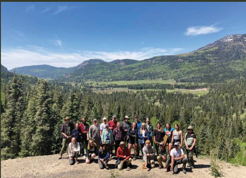
Summer Rec Camp, 2021